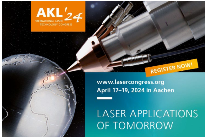
Image 3: Registration for AKL'24 is now open at www.lasercongress.org .

FRAUNHOFER INSTITUTE FOR LASERTECHNOLOGY ILT