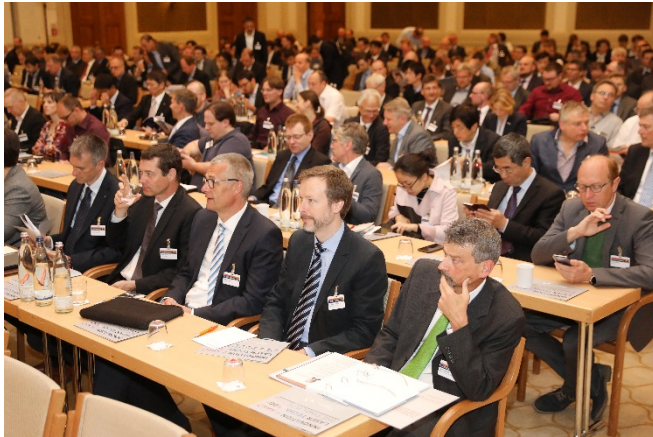
Image 1: More than 660 attendees, representing industrial laser manufacturers and users, met to enjoy a densely packed program with 77 presentations at AKL'18 in Aachen, Germany.

FRAUNHOFER INSTITUTE FOR LASER TECHNOLOGY ILT