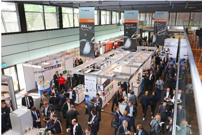
Image 3: A place for vivid discussions with 56 renowned manufacturers of lasers, components and systems: the sponsors' exhibition at AKL'18.