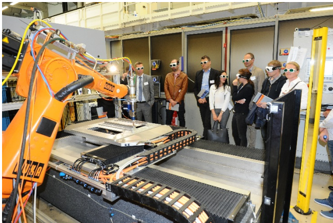
Image 4: Fraunhofer ILT opened its labs for "Laser Technology Live" during AKL'18 with more than 100 live demonstrations at Europe's largest laser application center.